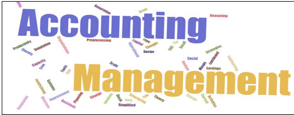
Figura 2: Nuvem de palavras

After analyzing the information identified in the bibliographical research, about the publications on the subject and its applicability in public and private organizations, in the next chapter an analysis of the publications related to the application of TOC in the public sector will be carried out.